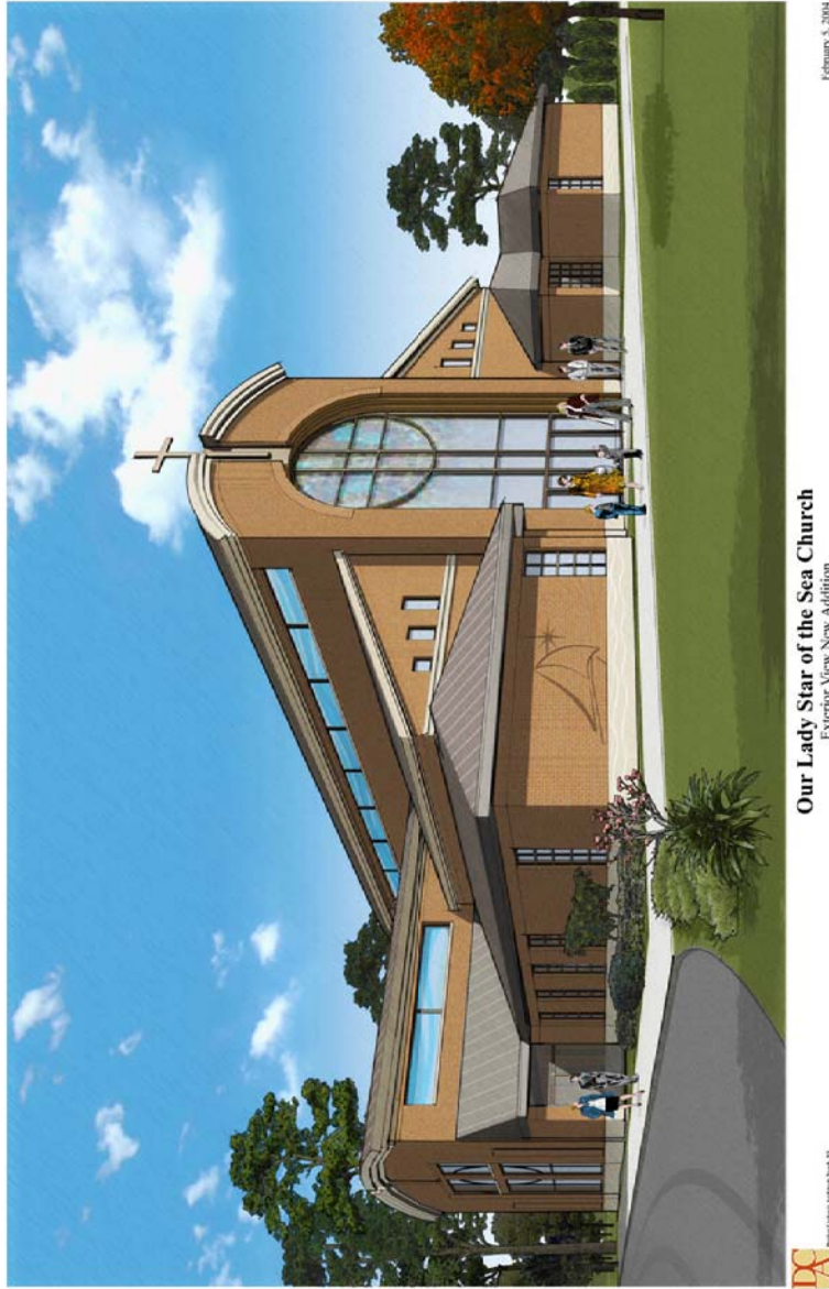
Our Lady Star of the Sea Church Exterior View New Addition