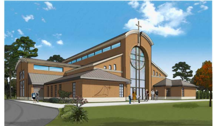
Our Lady Star of the Sea Church Exterior View New Addition