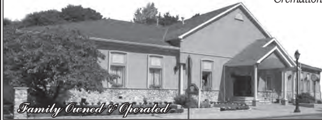
Family Owned & Operated

7447 Amboy Road Staten Island, NY 10307 718-984-0913