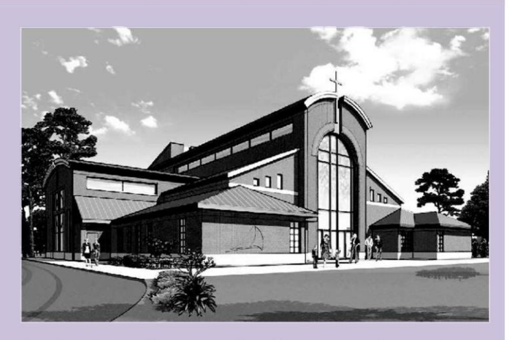
Our Parish Family invites all to be active and participating members in every aspect of parish life! We care for each other and want to worship and serve our Lord and one another.